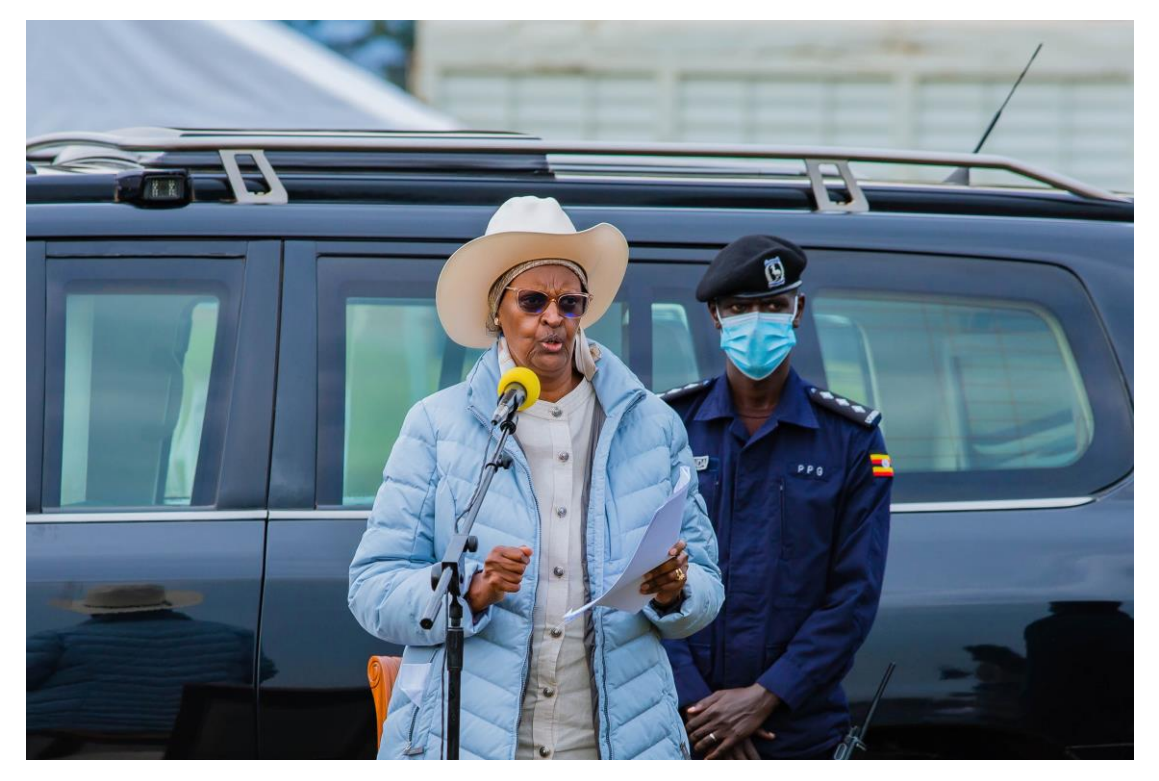
The First Lady and Minister of Education and Sports, Janet Museveni speaking to student leaders during the gathering at St. Henry's College Kitovu in Masaka on Thursday, September 18, 2024.

In her remarks, the First Lady and Hon. Minister of Education and Sports, expressed her pleasure with regard to the successful implementation of the Youth Summit in the Masaka Region.