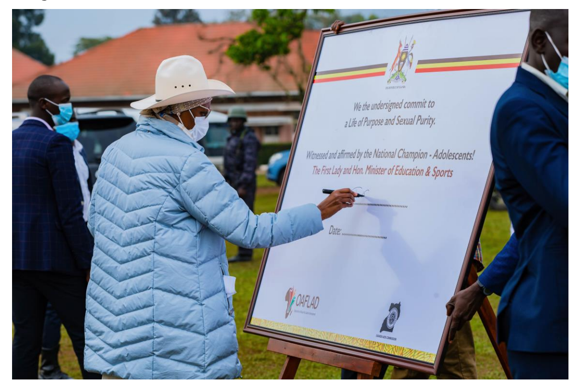
First Lady and Minister of Education and Sports, Janet Museveni signing on the board as the national champion for adolescents.

The First Lady and Hon. Minister of Education and Sports, then signed the True Love Waits Card, as a witness to its symbolic signing by student representatives on behalf of their peers and the head master of St. Henry's College Kitovu on behalf of parents and guardians.