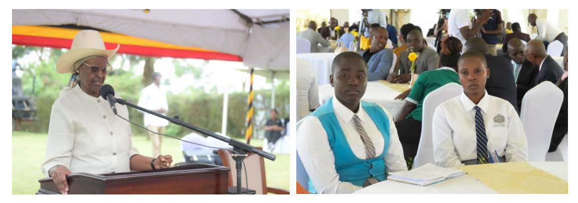
3.7 Remarks by the First Lady and Hon. Minister of Education and Sports

Summit and called upon them to urge their peers to become Champions of these teachings, when they go back to their schools.